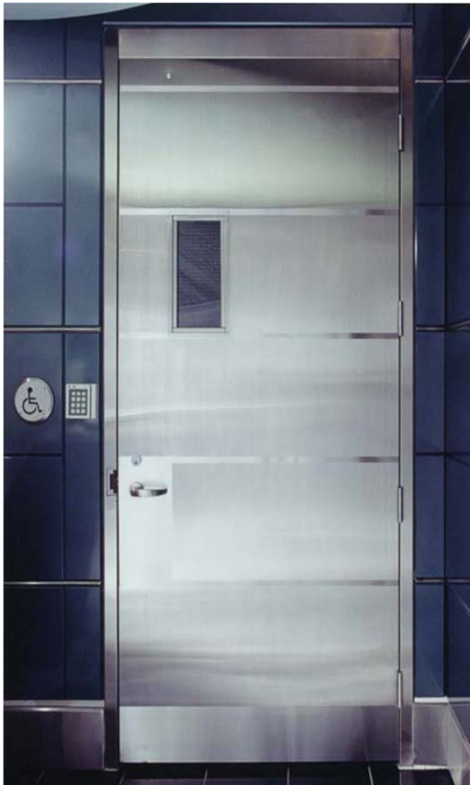
Stainless Steel Non-Fire Rated Doors with Special Accessories

Hollow Metal Doors can be customized to the customer's needs in terms of Design & Build. Our doors are manufactured according to American Standards ( ANSI ) or European Standards ( BS/EN ).