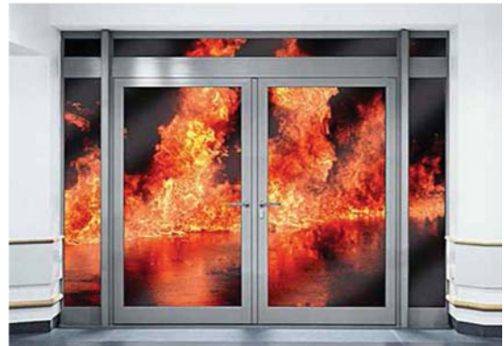
Stainless Steel Fire Rated Doors with Fire-Rated