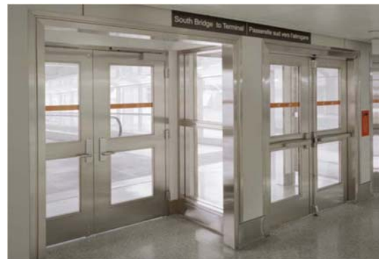
Stainless Steel Non-Fire Rated Doors